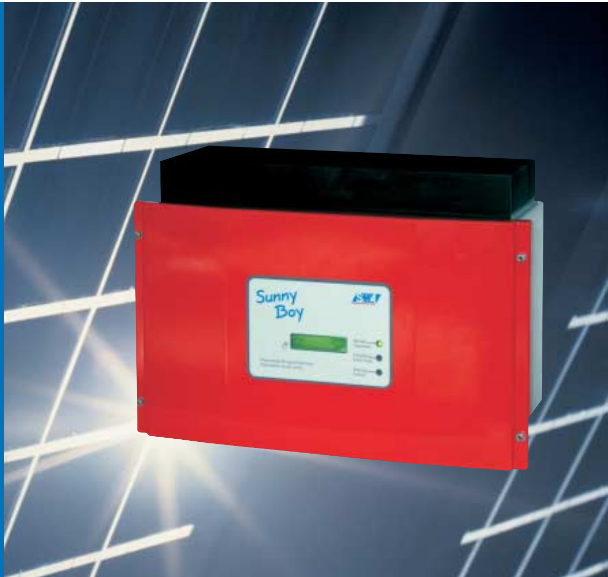
Shown with optional display

The SMA Sunny Boy inverter, the most popular grid-tied photovoltaic inverter in Europe, is now UL 1741 Listed and available in North America. Sunny Boy's extensive track record in some of the world's most demanding markets has made it the favorite among PV professionals everywhere. Over 200,000 Sunny Boy inverters have been installed worldwide. Having achieved the highest reliability of any PV inverter, Sunny Boy gained immediate acceptance in the US and Canadian markets. Superior design, rock-solid German engineering, and exceptional real-world efficiency have made Sunny Boy the top choice for American solar designers. These professionals know that Sunny Boy is a grid-tied inverter that they can recommend without reservation and install with confidence.